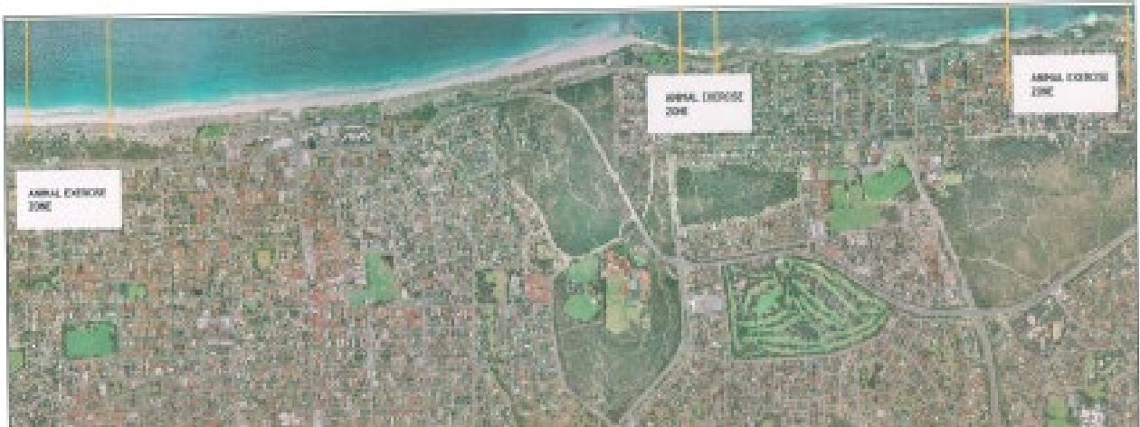
ANIMAL EXERCISE ZONES APPENDIX 2

Whilst fishing is classified as “medium conflict” in general, fishing in the pool area of Mettams Pool poses a high risk to users of this area. Therefore an exclusion zone to people fishing is applicable to the pool area of Mettams Pool. (Refer Appendix 3)