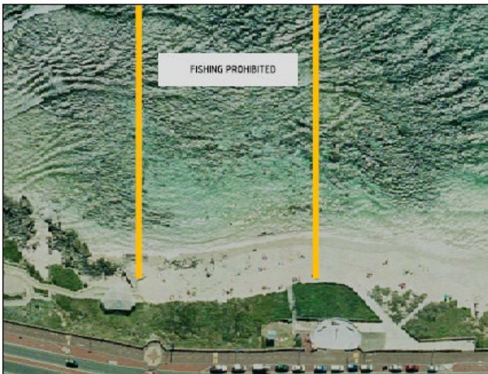
METTAMS POOL - FISHING PROHIBITED APPENDIX 3

Whilst fishing is classified as “medium conflict” in general, fishing in the pool area of Mettams Pool poses a high risk to users of this area. Therefore an exclusion zone to people fishing is applicable to the pool area of Mettams Pool. (Refer Appendix 3)